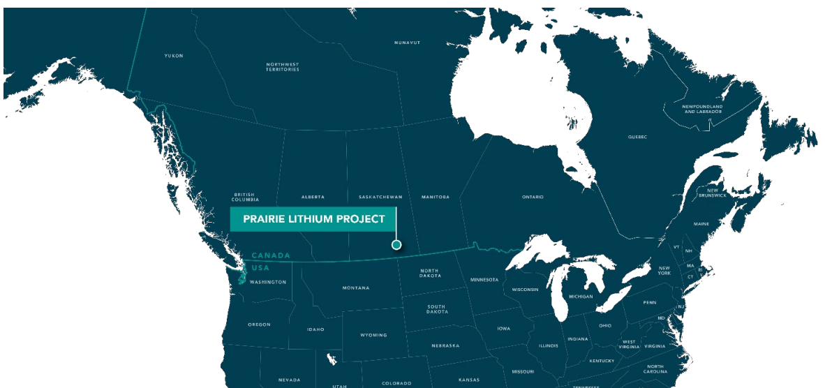
Figure 2: Location of the Prairie Lithium Project in Saskatchewan, Canada

AZL's Prairie Lithium Project is located in the Williston Basin of Saskatchewan, Canada. Located in one of the world's top mining friendly jurisdictions, the projects have easy access to key infrastructure including electricity, natural gas, fresh water, paved highways and railroads. The projects also aim to have strong environmental credentials, with Arizona Lithium targeting to use less use freshwater, land and waste, aligning with the Company's sustainable approach to lithium development.