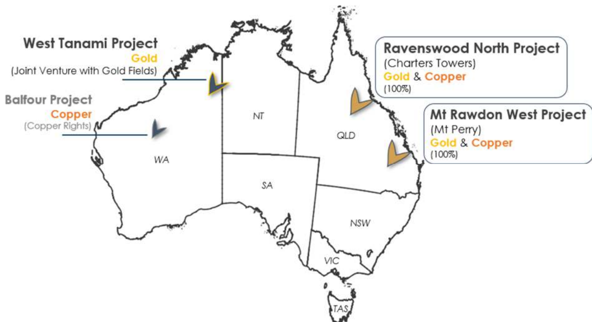
Figure 3. Location of Killi Resources Limited gold and copper projects in Australia.

The Company also retains copper rights to the Balfour Project in the Pilbara of Western Australia. Tenure held by Black Canyon (ASX: BCA).