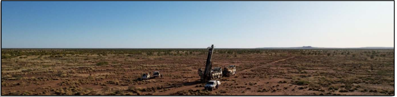
Figure 2. Exploration aircore drilling at the West Tanami Project in 2022.