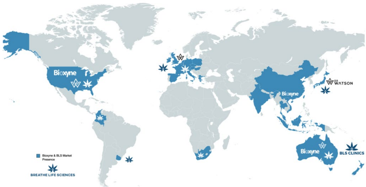
Figure 4 – Bioxyne Activity Worldwide