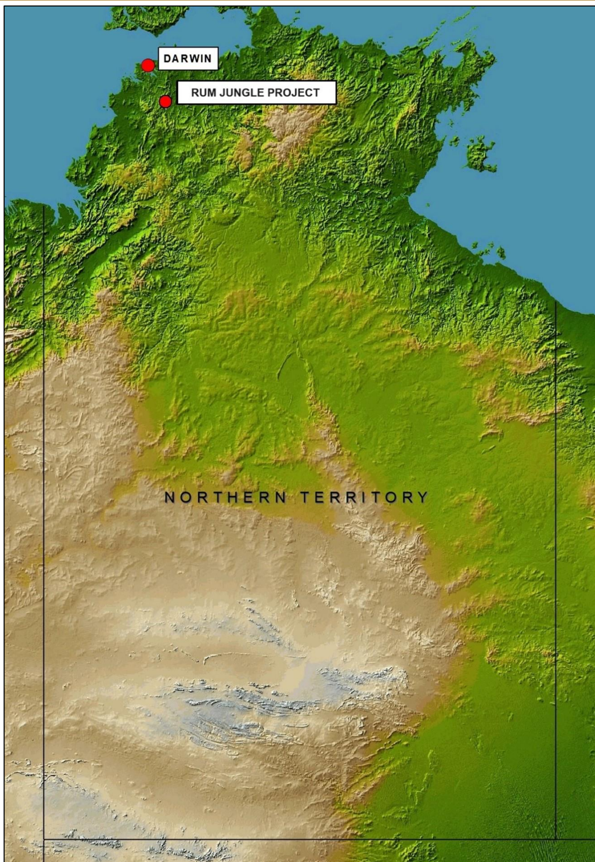
Figure 3 Rum Jungle Project location relative to Darwin