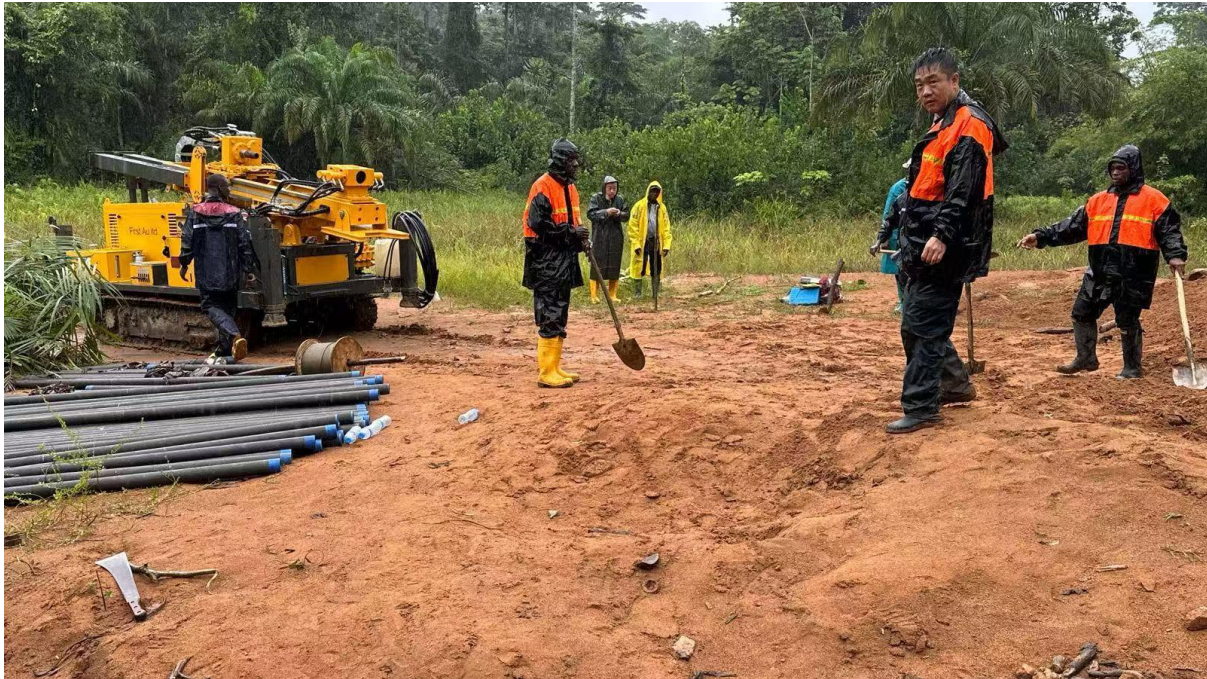
Figure 2: Initial drilling been prepared next to NZ22-001 of the Ziyatoya Prospect area