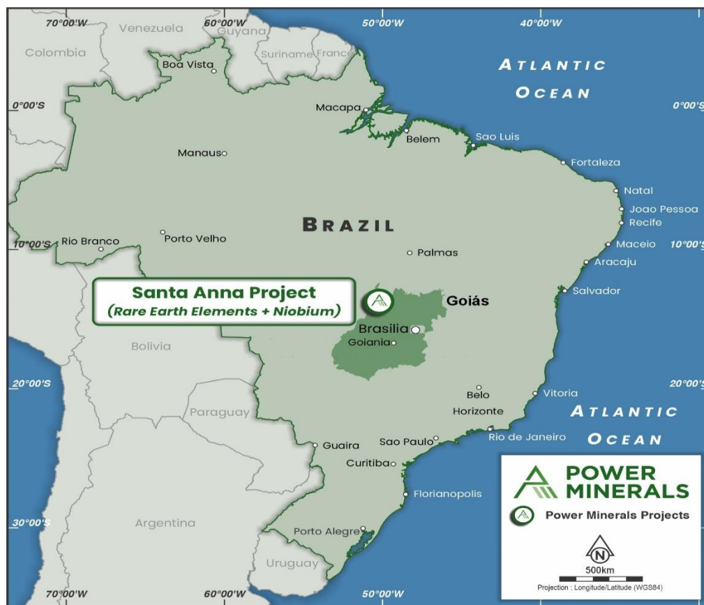
Figure 2. Santa Anna Project location map in Goiás State, central Brazil.

Power Minerals Limited is an ASX-listed exploration and development company. We are focused on transforming our lithium resources in Argentina, exploring our promising niobium and other critical mineral assets in Brazil, and maximizing value from our Australian assets.