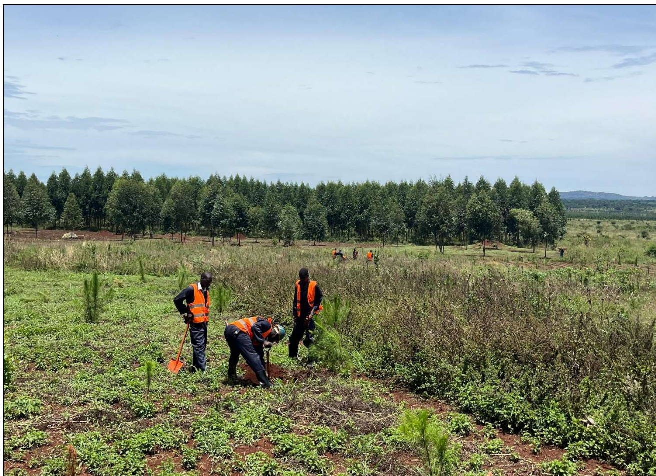
Figure 2: Field crew digging a hole to take a soil sample.