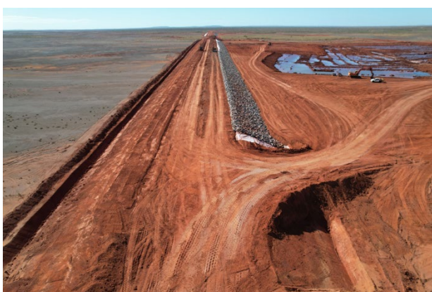
Figure 5: Pilbara Ports Road Construction