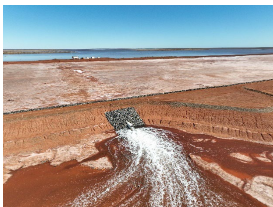
Figure 1: Commissioning Transfer Station 5/6

Fabrication of the salt harvester was awarded to Camco Engineering and progressed well in their Western Australian based facility.