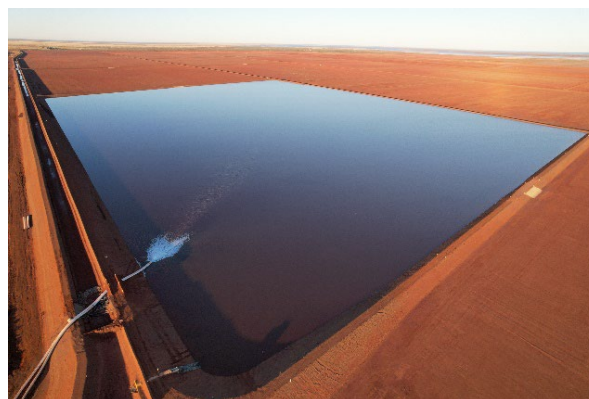
Figure 2: Filling Crystalliser C1-E1