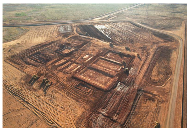
Figure 6: SOP Pilot Ponds