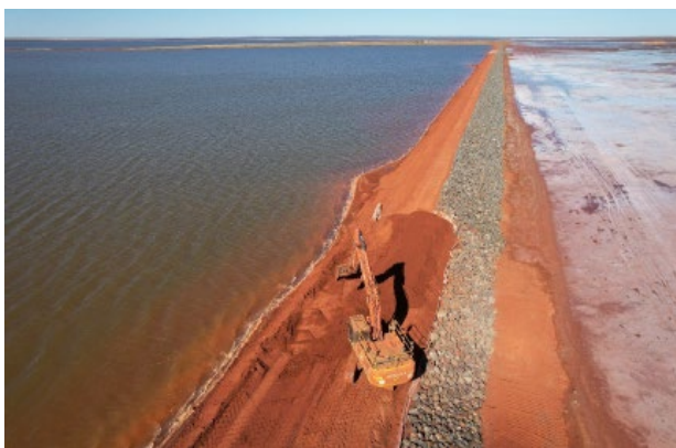
Figure 3: Rock Placement on Pond 5 Seawall