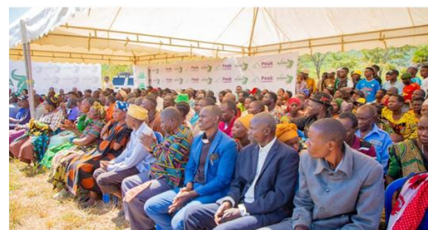
Students outside one of the recently constructed Ngwala High School classrooms and PAPS and other members of the community attending the celebration function.