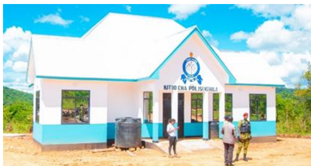
The formal handover and inauguration over the Ngwala Police Station.