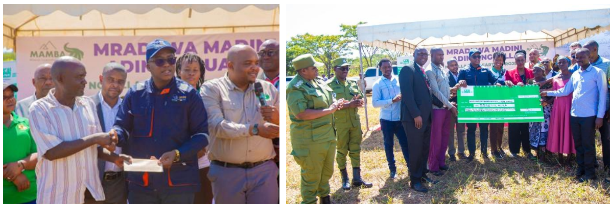
The Tanzanian Minister for Minerals, Hon. Anthony Mavunde handing over a ceremonial cheque and payment slips to PAP representatives to commemorate the launch of land compensation.