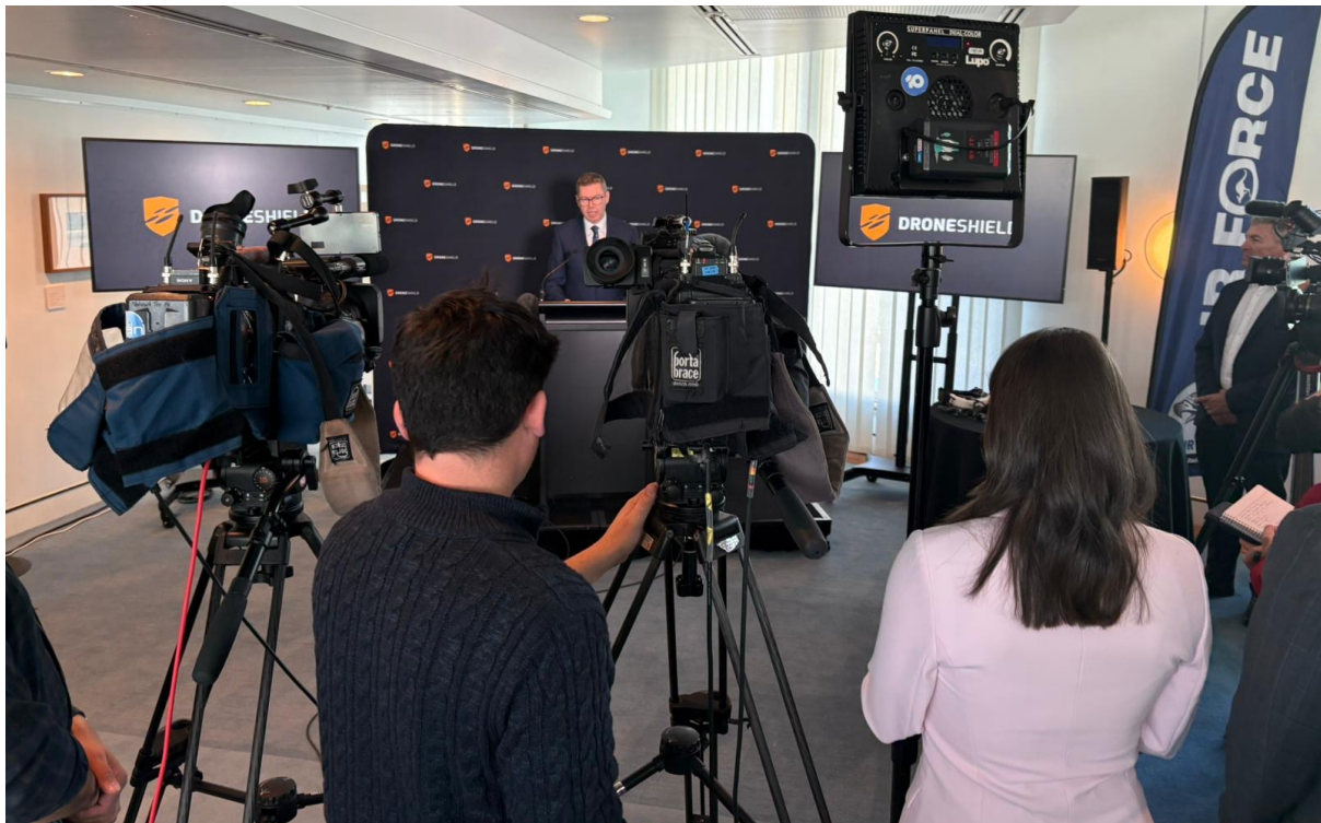
Image: Minister Conroy's LAND156 announcement

In addition to this equipment delivery, DroneShield stands ready to support the ADF as Systems Integration Partner under the broader LAND156 program. With deep expertise in sensor fusion, electronic warfare, and command-and-control integration, DroneShield is well positioned to contribute to the development of scalable, interoperable counter-drone architectures that meet Defence's evolving operational requirements.