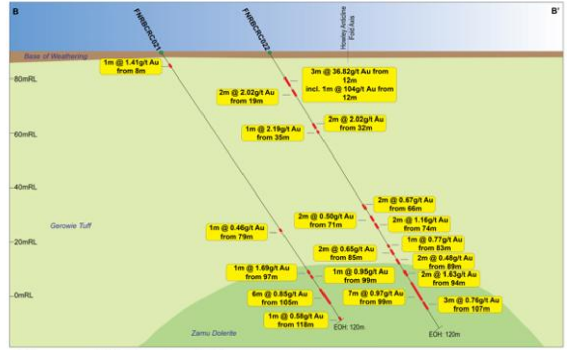
FIGURE 2: CROSS SECTION (A-A') & CROSS SECTION (B-B'): LOOKING NORTH ±20M SECTION VIEW, SHOWING INTERPRETED GEOLOGY AND SIGNIFICANT INTERSECTIONS (AU >0.30G/t). DRILLING RESULTS ARE DOWNHOLE WIDTH AND NOT TRUE WIDTH