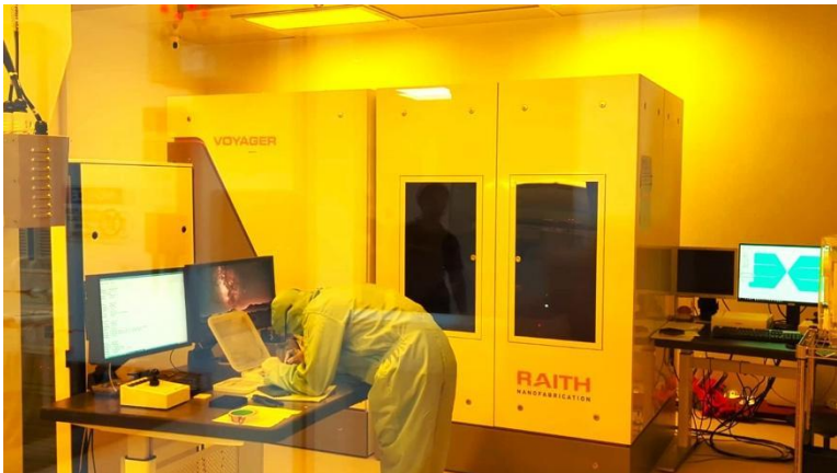
Figure 2: DVLs sensors being qualified in clean room

These performance improvements are not just significant theoretically, but they translate into tangible, system-level advantages that directly impact how dorsaVi’s sensors perform in real-world environments. By combining faster memory access, lower power draw, and greater endurance, RRAM technology enables a new class of wearable biomedical devices capable of operating more intelligently and reliably in demanding clinical and movement-monitoring scenarios.