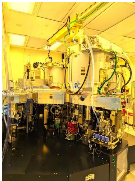
Figure 1: Deposition Machine