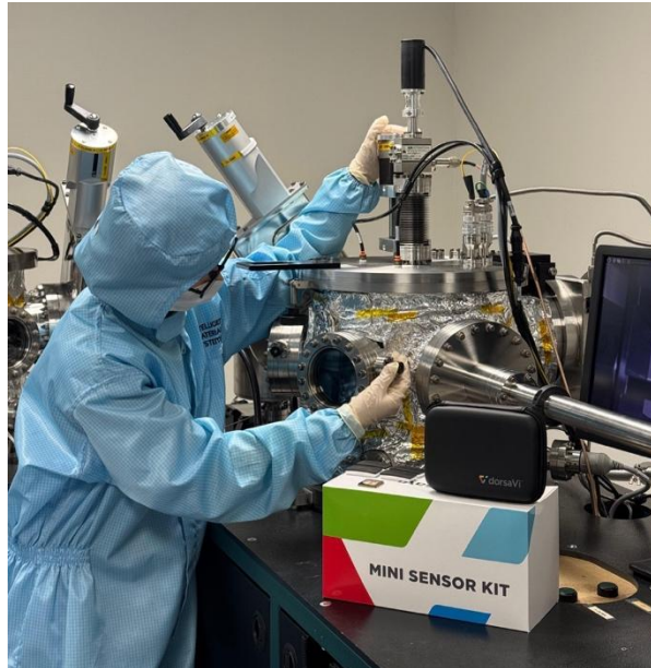
Figure 4: DVL sensors undergoing evaluation

While the immediate integration of RRAM enhances the performance of dorsaVi's core biomedical sensors, its broader potential is far-reaching. The same core advantages demonstrated exceptional responsiveness, minimal power draw, and the ability to withstand intensive, repeated use position RRAM as a critical building block for a new class of smart, connected devices. As demand grows for medical technologies that can process data locally, adapt in real time, and operate reliably in power-constrained environments, RRAM stands out as a strategic enabler across both clinical and embedded markets.