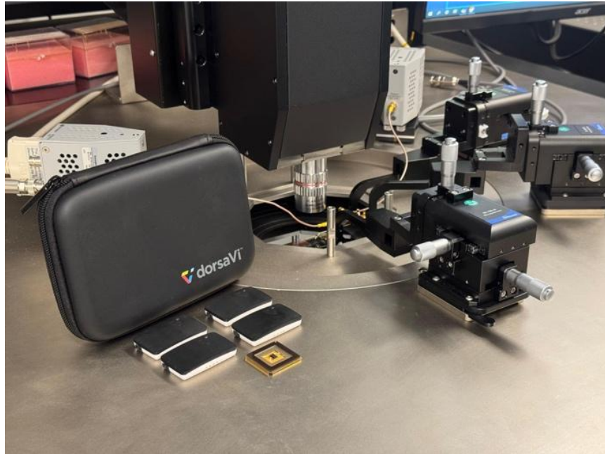
Figure 5: DVL sensor undergoing wafer-level testing

Each of these applications relies on memory that can operate efficiently, handle frequent use, and support fast, on-device decision-making areas where RRAM is particularly well suited, and where it can play a defining role in the future of biomedical technology.