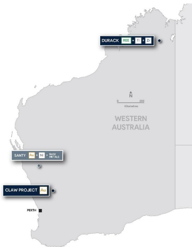
BPM Minerals Western Australian Projects