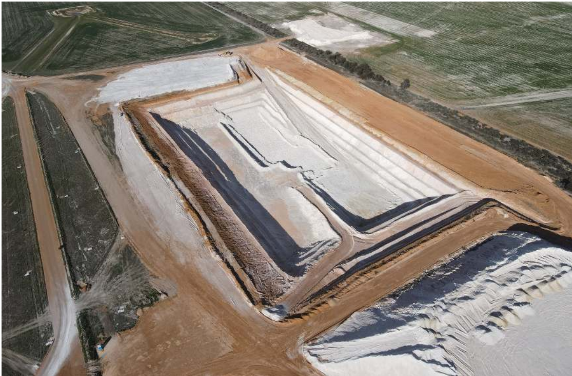
Figure 1 - Mining Operations at Wickepin