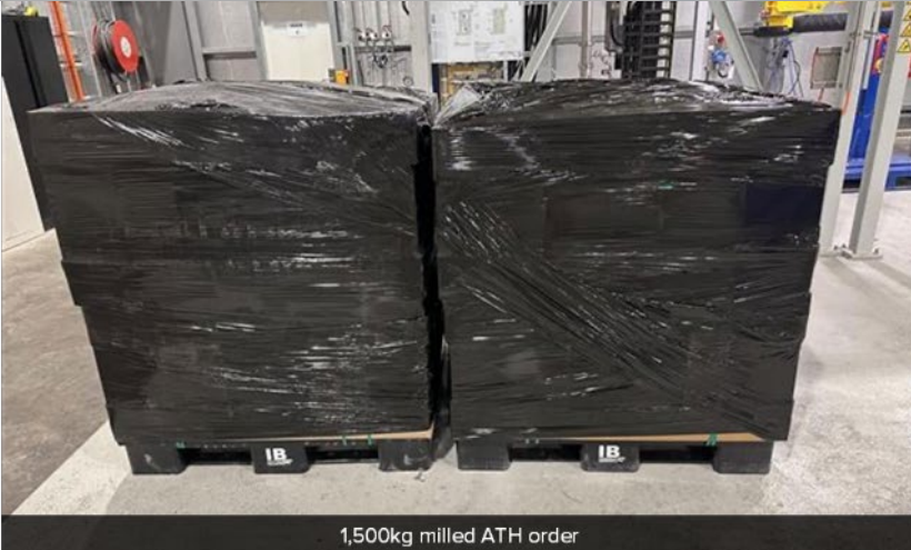
Selected product sales orders delivered during the quarter