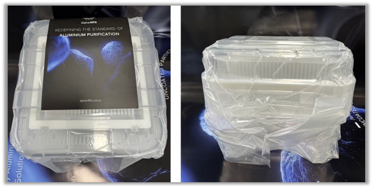
Cassette of completed 8" (200mm) sapphire wafers for GaN-on-sapphire semiconductor end-user (RHS)