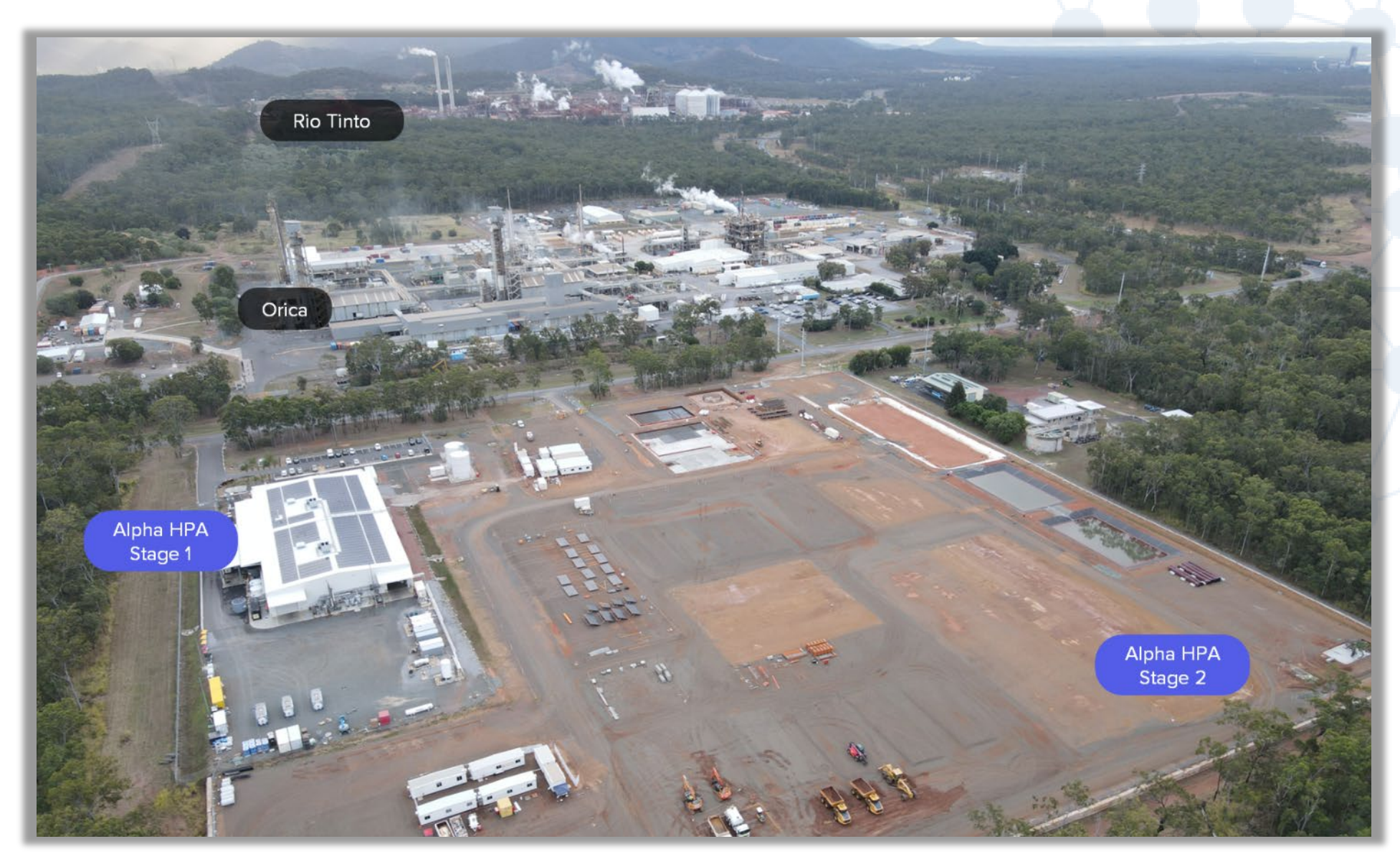
HPA First Project site looking west, showing completed earthworks and commencement of civil works Orica Yarwun in midground and Rio Tinto Yarwun alumina in background