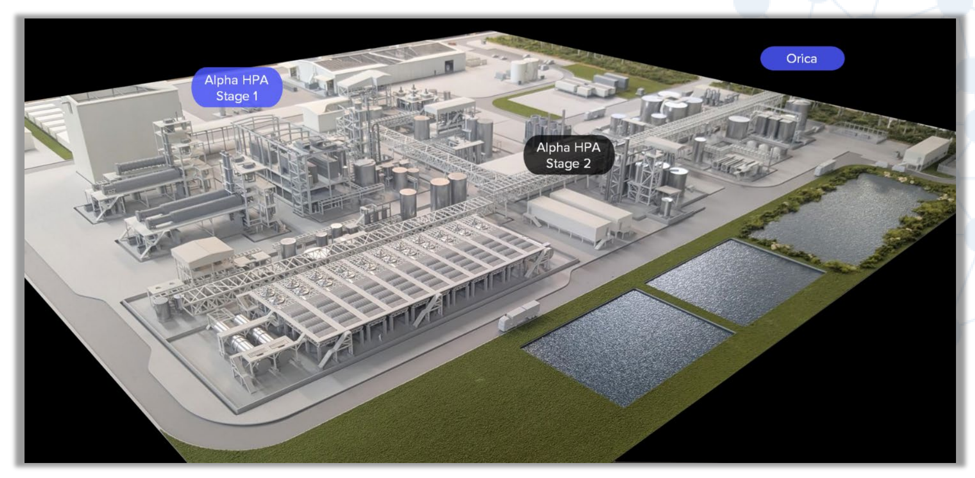
3D Model of final engineered layer of the HPA First Project